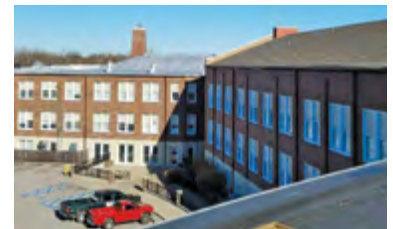
PHOTO: A new roof on the Main Building at Moberly Area Community College

window replacement in Komar Hall, and a roof repair project at the college's instructional site in Mexico. A roof repair project and the replacement of heating, ventilation, and air conditioning equipment at Komar Hall is nearing completion.