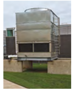
PHOTO: Cooling tower upgrades at St. Charles Community College

St. Charles Community College completed a parking lot replacement project in August 2016. A chiller and cooling tower were replaced during summer 2016. Additional upgrades, including automated accessibility doors; boiler; kitchen equipment; and heating, ventilation, and air conditioning equipment, will continue in 2017.