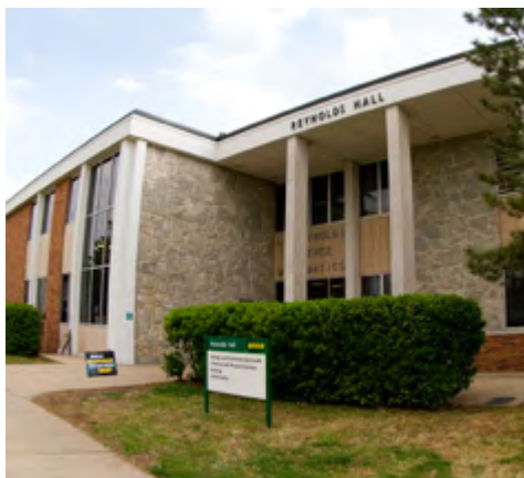
PHOTO: Renovation and expansion of Reynolds Hall at Missouri Southern State University

Missouri Southern State University in Joplin is renovating and expanding Reynolds Hall, a 50-year-old science and math facility. Renovations on the existing building are about 50 percent complete, and construction on a new addition will begin in spring 2017. The total project, which includes science labs and expanded classrooms, should be completed by summer 2018.