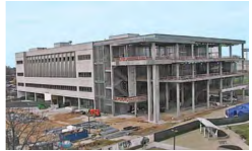
PHOTO: Construction on Glass Hall at Missouri State University

at Glass Hall continues. All renovation and new construction should be finished by August 2017. At Missouri State University–West Plains, design work is wrapping up on Missouri Hall, now named Hass-Darr Hall. Construction is expected to be completed in February 2018.