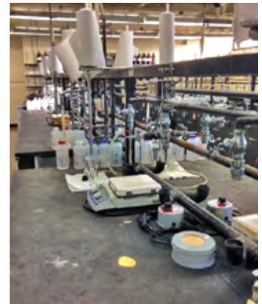
PHOTO: Renovation planned at the Spencer Chemistry/Biological Sciences Building at the University of Missouri-Kansas City

The University of Missouri-Kansas City will begin construction, including laboratory renovations, at the Spencer Chemistry/Biological Sciences Building in February 2017. The project is scheduled for completion in December 2018.