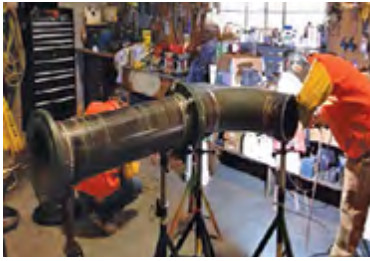
PHOTO: Upgrades to the Chiller Plant at Northwest Missouri State University

Northwest Missouri State University in Maryville has repair and renovation work, including electrical system repairs and window replacement, underway at a number of facilities including the Administration Building, B.D. Owens Library, Brown Hall, Chiller Plant, Colden Hall, Fine Arts Building, Gaunt House, Jon T. Rickman Electronic Campus Support Center, and Martindale Hall.