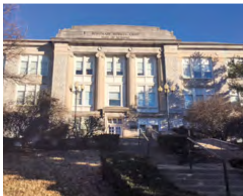
PHOTO: A new roof and window replacements planned for Crisp Hall

Southeast Missouri State University in Cape Girardeau is renovating Brandt Hall, Crisp Hall, and the Grauel Building. Construction at Brandt Hall will include updates to fire safety, mechanical, electrical, and plumbing systems. The roof will be replaced in summer 2017, and remaining renovations will be bid in 2018. At Crisp Hall, the roof and single-pane windows will be replaced by summer 2017. Interior renovations will be bid in fall 2017 and include replacement of the mechanical, electrical, and plumbing systems. Asbestos abatement is underway at the Grauel Building. Renovations to be completed in July 2017 include replacing mechanical, electrical, and plumbing systems and single-pane windows.