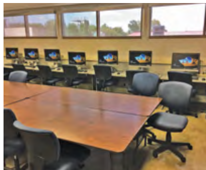
PHOTO: New computer lab at Crowder College's Webb City campus

Crowder College in Neosho is repurposing the Hickey Building, located on its Webb City campus, to include a student commons area, a study and tutoring area, new computer labs, and renovated classrooms and offices. Improvements to buildings on the main campus in Neosho include roof and masonry repairs, heating and air conditioning upgrades, and energy-efficient windows. Work on the Nevada campus includes classroom, office, and student study area improvements; electrical and plumbing upgrades; and energy-efficient windows. The projects should be completed in spring 2017.