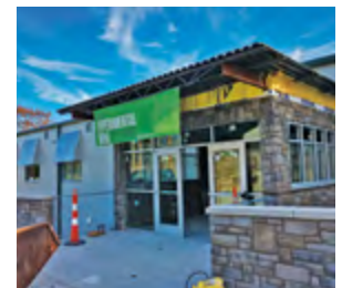
PHOTO: Construction at the Experimental Mine Building at Missouri University of Science and Technology

The Missouri University of Science and Technology in Rolla is nearing completion of a new building to support teaching and research activities at the school's Experimental Mine Building. Renovation work has begun at Schrenk Hall. Hazardous materials have been removed and demolition is in progress. Construction is scheduled for completion in October 2017.