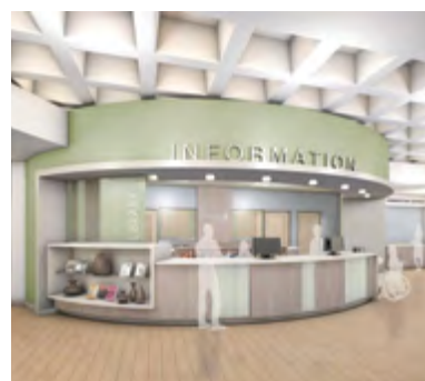
PHOTO: Artist rendering of library renovations at Jefferson College

Jefferson College in Hillsboro is in the process of renovating its library. Demolition began in late December 2016, and renovation will begin in spring 2017. Additional improvements are planned for the Student Center building.