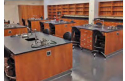
PHOTO: Renovated microbiology lab at St. Louis Community College's Forest Park Campus

St. Louis Community College is renovating science labs at the school's three original campuses — Florissant Valley, Forest Park, and Meramec. Work has been completed on 13 lab spaces. Two additional spaces have been bid and are scheduled for renovation in summer 2017. The renovations include ceilings; lighting; flooring; painting; casework; and technology, mechanical, electrical, and plumbing upgrades.