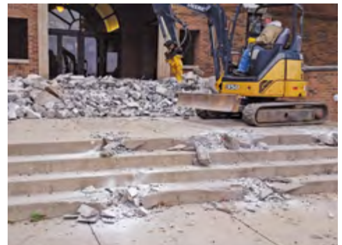
PHOTO: Front entrance repairs at the Hopkins Building at State Fair Community College

renovated restrooms at the Fielding/CTC building; and foundation repairs, window replacement, entrance repairs, a new elevator, and restroom upgrades at the Hopkins Building. Other improvements include roof coating, new flooring, and painting at the Melita Day Building; a new roof, foundation repairs, restroom renovations, and heating and air conditioning upgrades at the Potter Ewing Building; restroom renovations and exterior stucco repairs at the Stauffacher Building; and foundation repairs at the Yeater Building. All projects should be completed by April 2017.