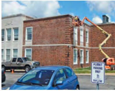
PHOTO: Tuck-pointing on Stamper Hall at Lincoln University

Lincoln University in Jefferson City is nearing completion on a number of improvements including roofing projects at Elliff Hall, Founders Hall, the Richardson Fine Arts Center, the Power Plant and Young Hall. Mechanical systems improvements, finish upgrades, and restroom renovations have been completed at Young Hall. The boiler has been replaced in Soldiers Hall. Restroom renovations are underway in Founders Hall and Martin Luther King Hall, and masonry tuck-pointing has begun on eight buildings.