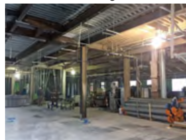
PHOTO: Construction at the College of Business and Administration Building at the University of Missouri-St. Louis

Construction is set to be completed in July 2018. Work has begun on the College of Business Administration Building and will include classrooms, offices, and student spaces. Construction should be complete by April 2017.