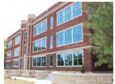
PHOTO: Interior and exterior improvements at Geyer Hall at North Central College

and ceiling finishes. Other improvements include fire safety, electrical, and plumbing upgrades; new windows; and new heating, ventilation, and air conditioning equipment. A new learning commons space was added to the building, and the library was renovated. New restrooms were added on each floor, and office spaces were reconfigured. Exterior improvements include tuck-pointing and new concrete walkways.