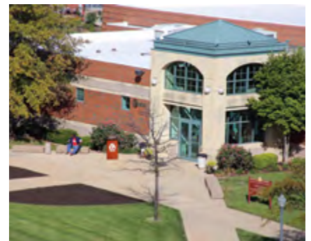
PHOTO: A new roof on the AT&T Library at Harris-Stowe State University

Harris-Stowe State University in St. Louis has completed numerous maintenance projects including replacing the library roof, removing mold and repainting the gymnasium, remodeling the athletic equipment room, refinishing the stage floor, and waterproofing the chiller room. Other projects underway include remodeling the back stage area and dance studio. Improvements to the Vashon Center include removing hazardous materials and upgrading climate control, electrical, and plumbing systems.