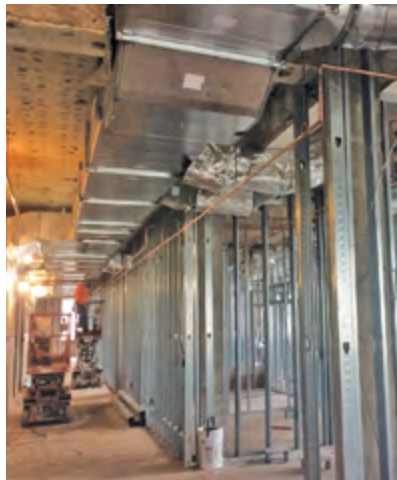
PHOTO: Renovation work at Baldwin Hall at Truman State University

Truman State University in Kirksville is renovating more than 20 classrooms, including computer and language labs, and offices for faculty and support staff at Baldwin Hall. The work includes accessibility improvements, energy-efficient lighting, and replacement of heating, ventilation, and air conditioning equipment. The project will be completed by August 2017.