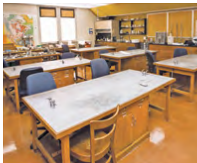
PHOTO: Laboratory at the Morris Science Building at University of Central Missouri

The University of Central Missouri in Warrensburg has begun work on several repair and renovation projects at the Morris Science Building. Improvements include more classroom and laboratory space, new cabinetry, flooring and lighting upgrades, support infrastructure repairs, and exterior renovations. The project should be completed by August 2017.