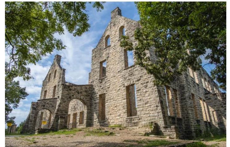
Ha Ha Tonka State Park